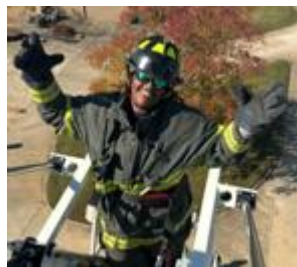
Autism Awareness Month