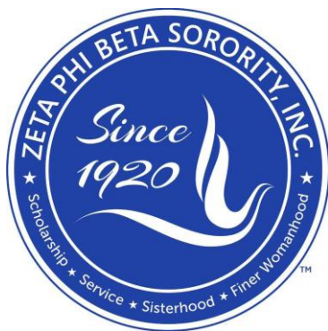
Mu Omega Zeta News Pages 8-10