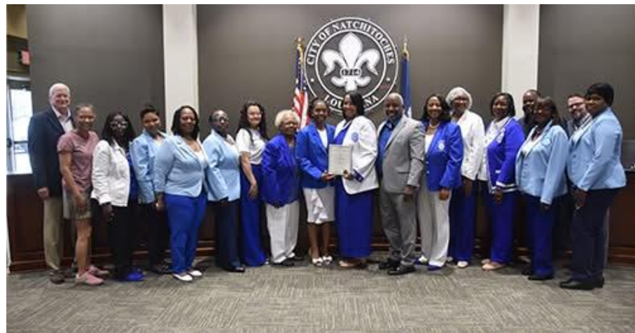
Zeta Phi Beta Sorority with Amicae of Natchitoches at City Council Meeting