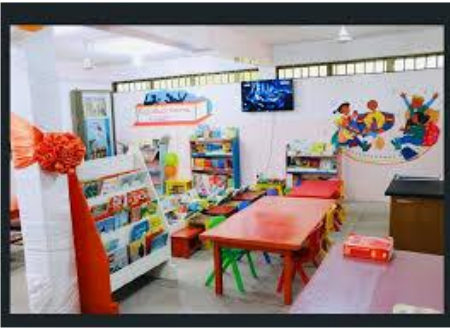
Donated to Cape Coast Children's Library in Ghana