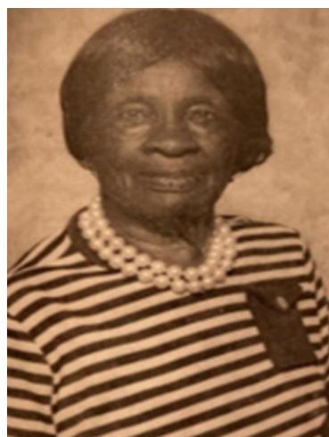
Mama Sug Says... Page 15