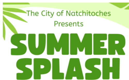
Summer Splash Page 15